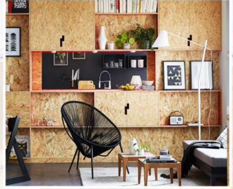
Living Room Interior